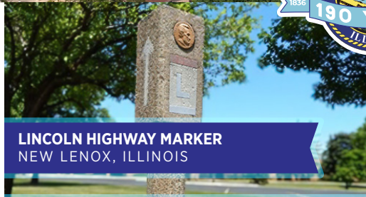
LINCOLN HIGHWAY MARKER NEW LENOX, ILLINOIS